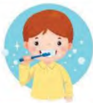
brush your teeth