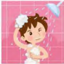
take a shower

karate – wake up – take a shower – work out – brush your teeth